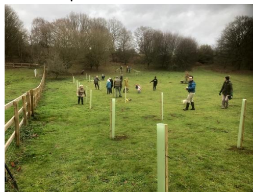
Tree planting brought villagers together on 11th January

Saturday 23rd Annual Jumble Sale with Bric-a-Brac, Books, Refreshments etc. 2pm Bawdsey Village Hall